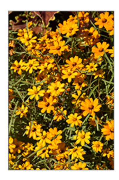
Star Gold Zinnia flowers

Star Gold Zinnia will grow to be about 14 inches tall at maturity, with a spread of 8 inches. When grown in masses or used as a bedding plant, individual plants should be spaced approximately 6 inches apart. Its foliage tends to remain dense right to the ground, not requiring facer plants in front. This fast-growing annual will normally live for one full growing season, needing replacement the following year.