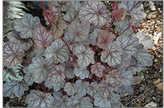
Regina Coral Bells foliage