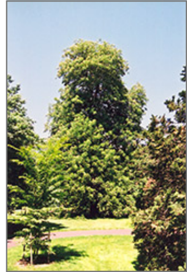
Yellow Buckeye

Yellow Buckeye is recommended for the following landscape applications;