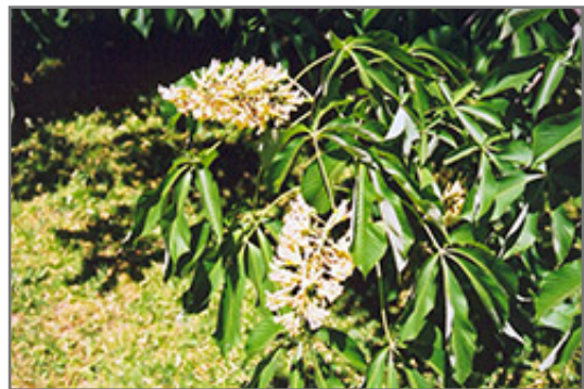
Yellow Buckeye flowers