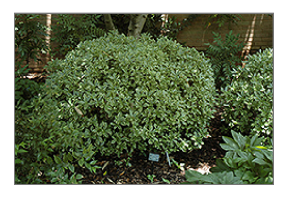
White Winter Daphne