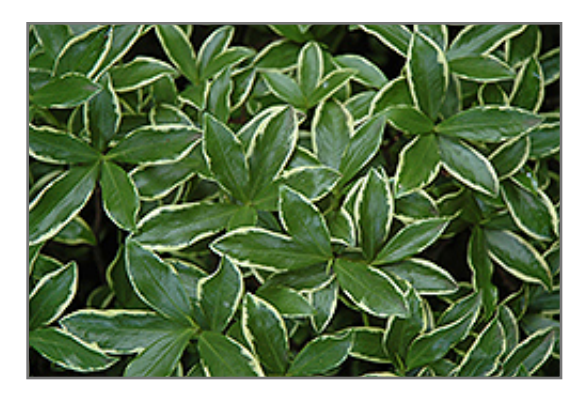
White Winter Daphne foliage

(336) 288–8893 newgarden.com New Garden Gazebo 3811 Lawndale Dr. Greensboro