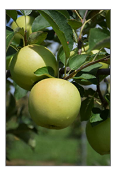
Golden Delicious Apple fruit

Golden Delicious Apple features showy clusters of lightly-scented white flowers with shell pink overtones along the branches in mid spring, which emerge from distinctive pink flower buds. It has forest green deciduous foliage. The pointy leaves turn yellow in fall. The fruits are showy chartreuse apples with yellow overtones, which are carried in abundance in mid fall. The fruit can be messy if allowed to drop on the lawn or walkways, and may require occasional clean-up.