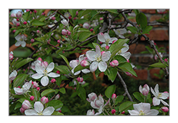
Golden Delicious Apple flowers