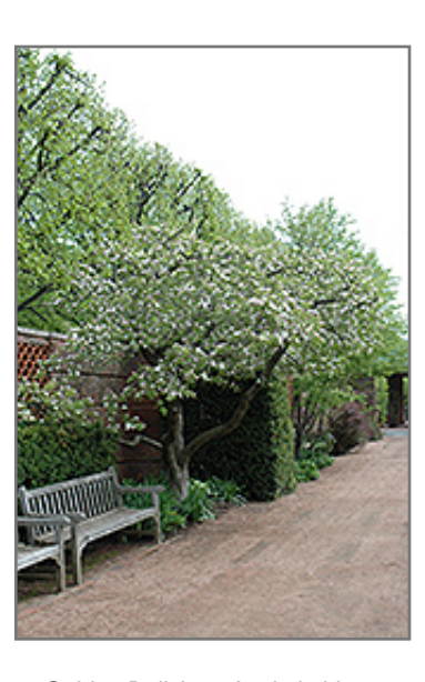
Golden Delicious Apple in bloom

This tree is typically grown in a designated area of the yard because of its mature size and spread. It should only be grown in full sunlight. It prefers to grow in average to moist conditions, and shouldn't be allowed to dry out. It is not particular as to soil type or pH. It is highly tolerant of urban pollution and will even thrive in inner city environments. This particular variety is an interspecific hybrid.