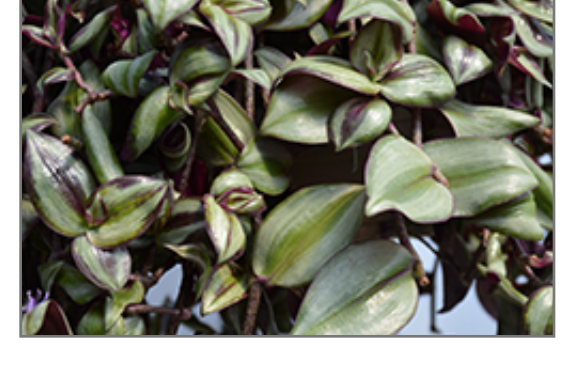
Wandering Jew foliage