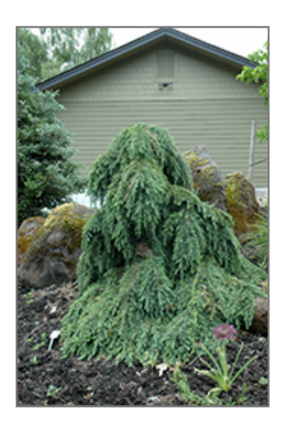
Feelin' Blue Deodar Cedar