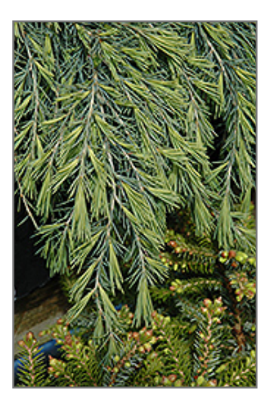
Feelin' Blue Deodar Cedar foliage