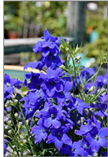
Diamonds Blue Delphinium flowers