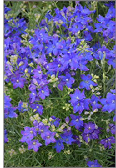
Diamonds Blue Delphinium flowers

Diamonds Blue Delphinium is recommended for the following landscape applications;