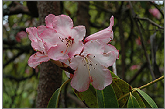
Roseum Fortune Rhododendron flowers