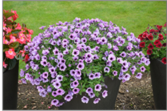
Supertunia Bordeaux Petunia in bloom

Supertunia Bordeaux Petunia is a fine choice for the garden, but it is also a good selection for planting in outdoor containers and hanging baskets. Because of its trailing habit of growth, it is ideally suited for use as a 'spiller' in the 'spiller-thriller-filler' container combination; plant it near the edges where it can spill gracefully over the pot. Note that when growing plants in outdoor containers and baskets, they may require more frequent waterings than they would in the yard or garden.