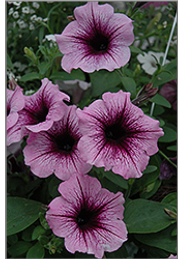
Supertunia Bordeaux Petunia flowers