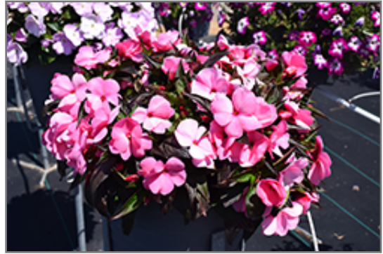
Sonic Light Pink New Guinea Impatiens in bloom

Sonic Light Pink New Guinea Impatiens will grow to be about 12 inches tall at maturity, with a spread of 12 inches. When grown in masses or used as a bedding plant, individual plants should be spaced approximately 10 inches apart. Its foliage tends to remain dense right to the ground, not requiring facer plants in front. This fast-growing annual will normally live for one full growing season, needing replacement the following year.