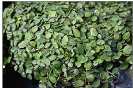
County Park Star Creeper foliage