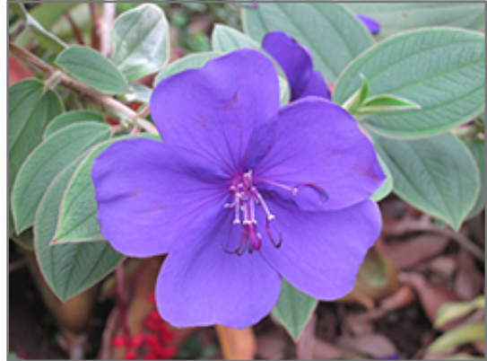
Princess Flower flowers

Princess Flower is recommended for the following landscape applications;