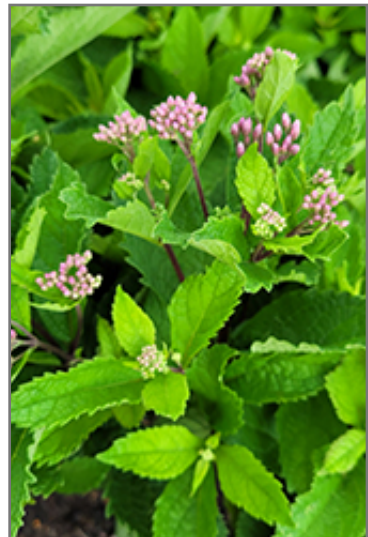
Phantom Joe Pye Weed flower buds