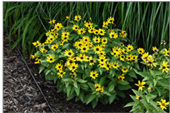
Sunburst False Sunflower in bloom