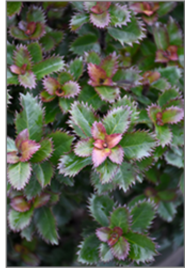
Sallywag Holly foliage