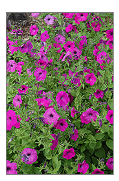
Laura Bush Petunia flowers

Laura Bush Petunia will grow to be about 18 inches tall at maturity, with a spread of 30 inches. When grown in masses or used as a bedding plant, individual plants should be spaced approximately 24 inches apart. Its foliage tends to remain dense right to the ground, not requiring facer plants in front. This fast-growing annual will normally live for one full growing season, needing replacement the following year.