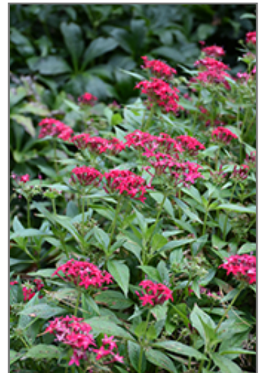
Graffiti Lipstick Star Flower flowers