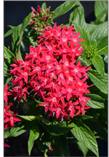
Graffiti Lipstick Star Flower flowers

Graffiti Lipstick Star Flower is recommended for the following landscape applications;