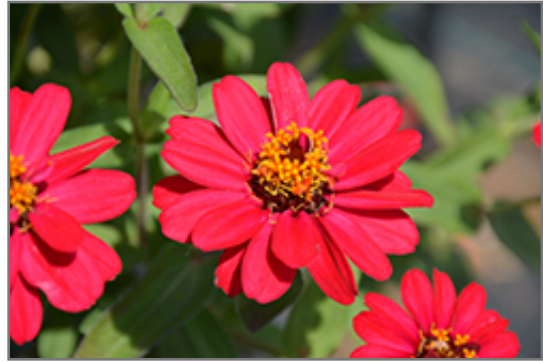
Profusion Double Hot Cherry Zinnia flowers