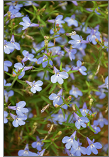
Techno Light Blue Lobelia flowers

Techno Light Blue Lobelia will grow to be about 8 inches tall at maturity, with a spread of 12 inches. When grown in masses or used as a bedding plant, individual plants should be spaced approximately 10 inches apart. Its foliage tends to remain low and dense right to the ground. Although it's not a true annual, this fast-growing plant can be expected to behave as an annual in our climate if left outdoors over the winter, usually needing replacement the following year. As such, gardeners should take into consideration that it will perform differently than it would in its native habitat.