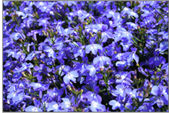
Techno Light Blue Lobelia flowers

Techno Light Blue Lobelia is recommended for the following landscape applications;