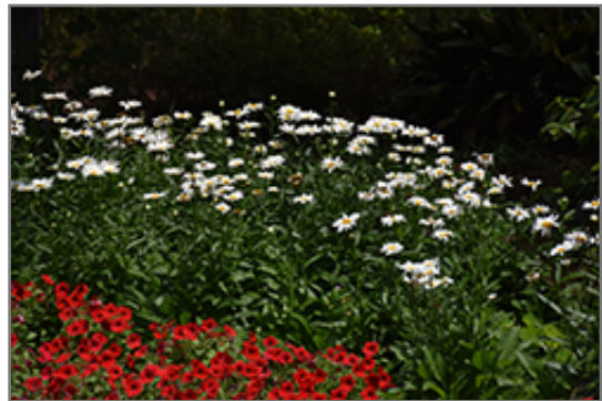
Brightside Shasta Daisy in bloom