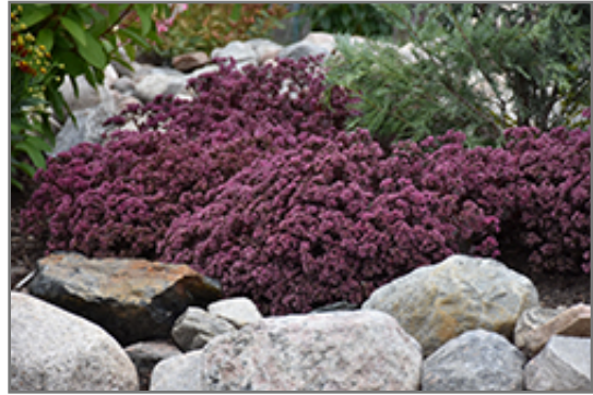
Cherry Tart Stonecrop in bloom

Cherry Tart Stonecrop is a dense herbaceous perennial with an upright spreading habit of growth. Its medium texture blends into the garden, but can always be balanced by a couple of finer or coarser plants for an effective composition.