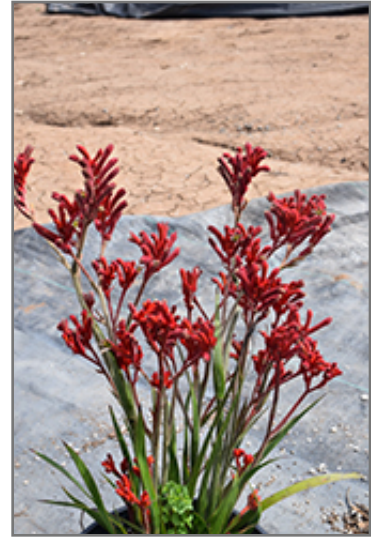
Kanga Red Kangaroo Paw in bloom