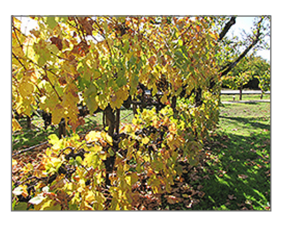
Merlot Grape in fall