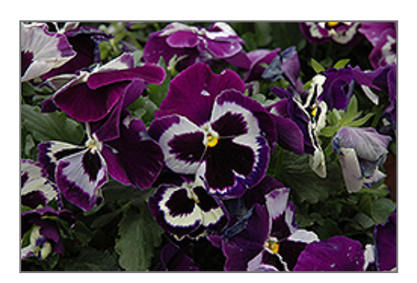
Delta Violet With Face Pansy flowers