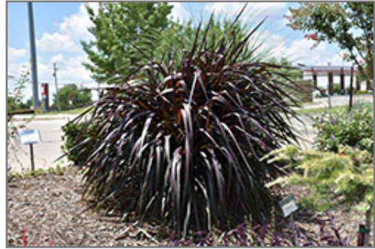
Princess Caroline Fountain Grass

Princess Caroline Fountain Grass is recommended for the following landscape applications;