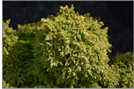
Twinkle Toes Japanese Cedar foliage