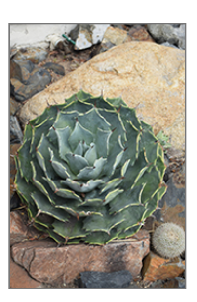
Parry's Agave

When grown indoors, Parry's Agave can be expected to grow to be about 24 inches tall at maturity extending to 6 feet tall with the flowers, with a spread of 24 inches. It grows at a slow rate, and under ideal conditions can be expected to live for approximately 10 years. This houseplant will do well in a location that gets either direct or indirect sunlight, although it will usually require a more brightly-lit environment than what artificial indoor lighting alone can provide. It prefers dry to average moisture levels with very well-drained soil, and may die if left in standing water for any length of time. This plant should be watered when the surface of the soil gets dry, and will need watering approximately once each week. Be aware that your particular watering schedule may vary depending on its location in the room, the pot size, plant size and other conditions; if in doubt, ask one of our experts in the store for advice. It is not particular as to soil pH, but grows best in poor soil. Contact the store for specific recommendations on pre-mixed potting soil for this plant.