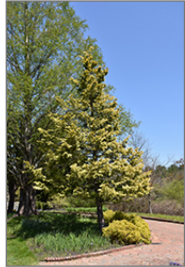
Cripps Gold Falsecypress

This tree does best in full sun to partial shade. It prefers to grow in average to moist conditions, and shouldn't be allowed to dry out. It is not particular as to soil type or pH. It is highly tolerant of urban pollution and will even thrive in inner city environments, and will benefit from being planted in a relatively sheltered location. Consider applying a thick mulch around the root zone in winter to protect it in exposed locations or colder microclimates. This is a selected variety of a species not originally from North America.