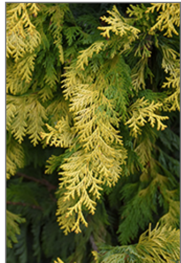
Cripps Gold Falsecypress foliage