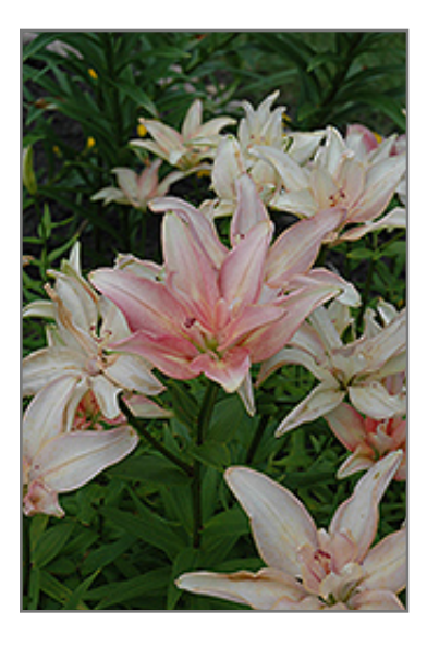
Aphrodite Lily flowers

Aphrodite Lily features bold shell pink trumpet-shaped flowers with salmon overtones at the ends of the stems in early summer. The flowers are excellent for cutting. Its narrow leaves remain green in color throughout the season.