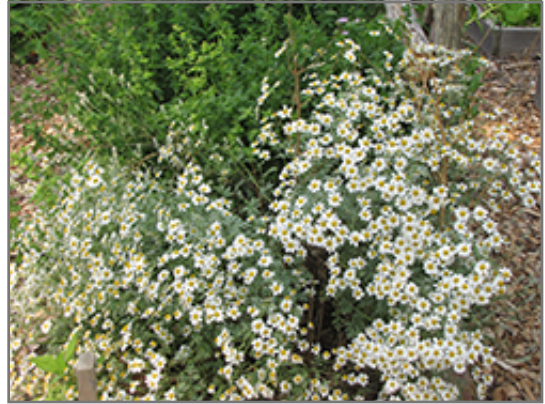
German Chamomile

This plant is quite ornamental as well as edible, and is as much at home in a landscape or flower garden as it is in a designated herb garden. It does best in full sun to partial shade. It is very adaptable to both dry and moist locations, and should do just fine under typical garden conditions. It is not particular as to soil type or pH. It is somewhat tolerant of urban pollution. This species is not originally from North America.