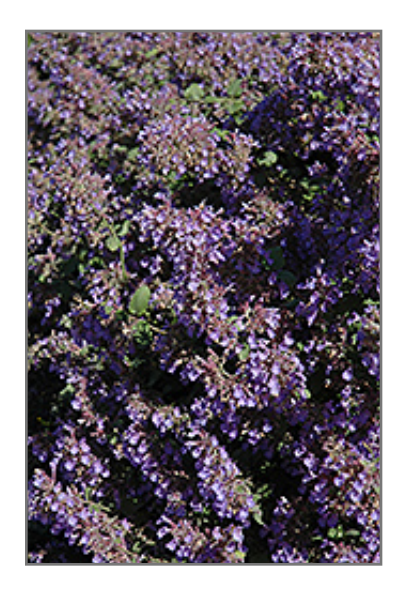
Walker's Low Catmint flowers

(336) 288–8893 newgarden.com New Garden Gazebo 3811 Lawndale Dr. Greensboro