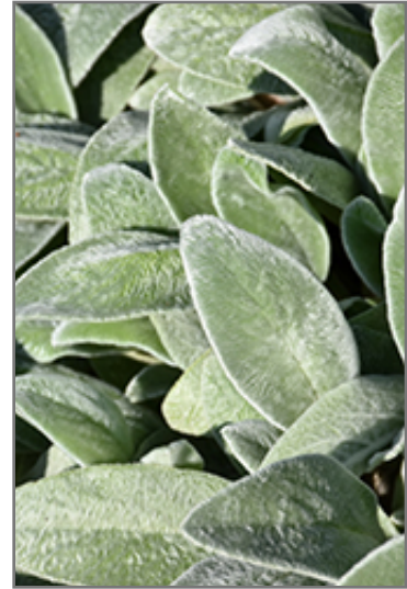
Lamb's Ears foliage

Lamb's Ears is recommended for the following landscape applications;