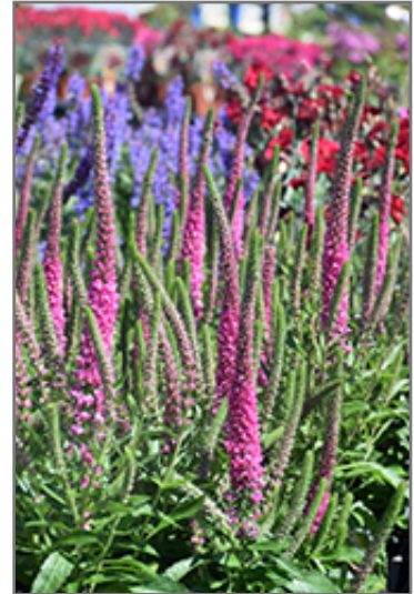
Red Fox Speedwell flowers

Red Fox Speedwell is recommended for the following landscape applications;