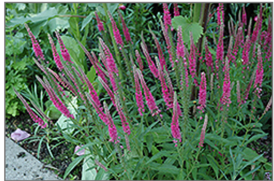
Red Fox Speedwell flowers