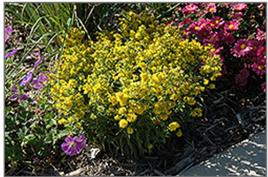
Goldrush Goldenrod in bloom