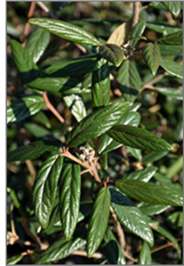
Prague Viburnum foliage

This shrub does best in full sun to partial shade. It prefers to grow in average to moist conditions, and shouldn't be allowed to dry out. It is not particular as to soil type or pH. It is highly tolerant of urban pollution and will even thrive in inner city environments. This particular variety is an interspecific hybrid.