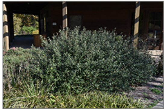
Prague Viburnum