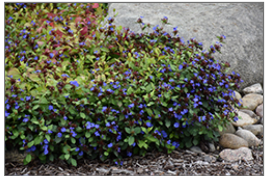
Plumbago in bloom