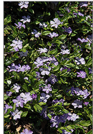
Common Periwinkle in bloom