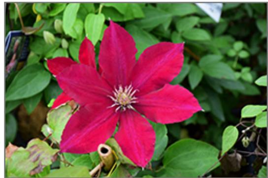
Rebecca Clematis flowers