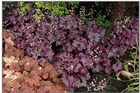
Plum Royale Coral Bells in bloom