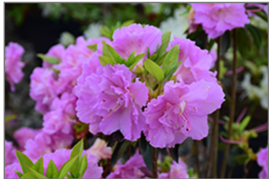
Elsie Lee Azalea flowers