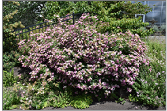
Lemon Princess Spirea in bloom

Lemon Princess Spirea will grow to be about 24 inches tall at maturity, with a spread of 3 feet. It tends to fill out right to the ground and therefore doesn't necessarily require facer plants in front. It grows at a fast rate, and under ideal conditions can be expected to live for approximately 20 years.