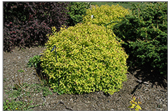
Lemon Princess Spirea