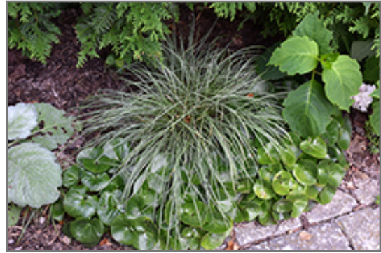
Snowline Miniature Variegated Sedge

Snowline Miniature Variegated Sedge is recommended for the following landscape applications;