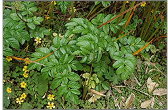
Angelica foliage