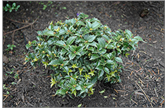
Rock Garden Holly