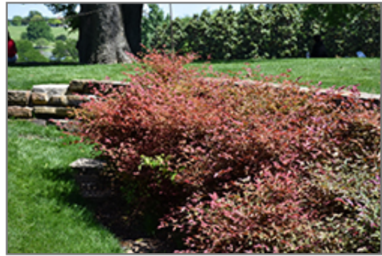
Flirt Nandina

Flirt Nandina is recommended for the following landscape applications;