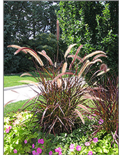
Purple Fountain Grass flowers

Purple Fountain Grass is recommended for the following landscape applications;