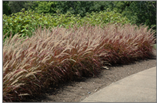
Purple Fountain Grass in bloom

Purple Fountain Grass will grow to be about 4 feet tall at maturity, with a spread of 3 feet. It grows at a medium rate, and under ideal conditions can be expected to live for approximately 10 years. As an herbaceous perennial, this plant will usually die back to the crown each winter, and will regrow from the base each spring. Be careful not to disturb the crown in late winter when it may not be readily seen!