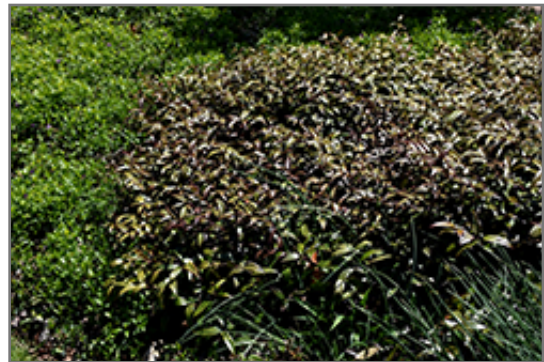
Scarletta Fetterbush