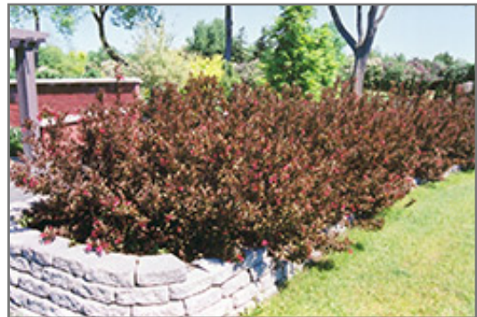
Wine and Roses Weigela