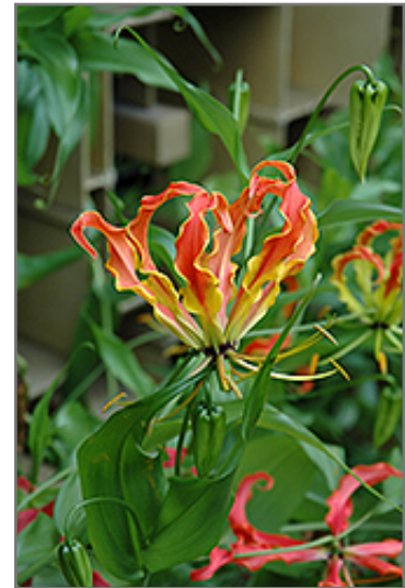
Gloriosa Lily flowers

Gloriosa Lily is recommended for the following landscape applications;